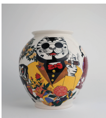
07 Jihye Han, When Tigers Used to Smoke , 2023, porcelain, underglaze, glaze, Cone 6 oxidation fired, 8 x 7.5 x 7.5 inches. $3000