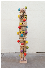
18 Clara Hoag, In Over Your Head , 2024, fired ceramic and glaze, 36 x 7.5 x 6.75 inches. $3750