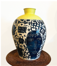
19 Yeonsoo Kim, You are not alone , 2023, white stoneware, underglaze, Sgraffito, cone 6, 17.5 x 13 x 13 inches. $2500