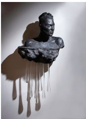
13 Alejandra Almuelle, Que Asi Sea , 2020, stoneware, glass, 40 x 18 x 10 inches. $15,000