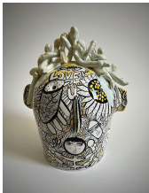
20 Yeonsoo Kim, Self Portrait , 2024, porcelain, glaze, underglaze, cone 6, 12 x 8 x 9.5 inches. $1700