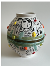
21 Yeonsoo Kim, Moon Jar - Never Ending Story , 2024, porcelain, colored clay, glaze, underglaze, cone 6, 13 x 12 x 12 inches. $2500