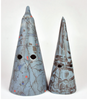
29 Tammie Rubin, Always & Forever (forever, ever) No.24, 2024 , pigmented porcelain, underglaze, 12 x 9.5 x 6 inches. $1750