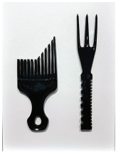
24 Christina Coleman, Variation on the Pick #8 & Variation on the Styler Tool Comb #12 , 2017, earthenware, casting slip, ceramic glaze, 13.25 x 10 inches. $900