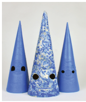
25 Tammie Rubin, Always & Forever (forever, ever) No.18 , 2024, pigmented porcelain, underglaze, 13.25 x 11.75 x 9 inches. $2750