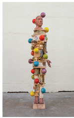
17 Clara Hoag, Bubble , 2024, fired ceramic and glaze, 33 x 7 x 6.75 inches. $3750