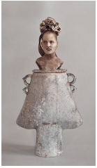
15 Alejandra Almuelle, The Body is a Place -Vase #1 , 2022, earthenware, 24 x 14 x 5 inches. $5000