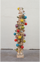
16 Clara Hoag, Hark , 2024, fired ceramic and glaze, 33.25 x 9 x 7 inches. $4000