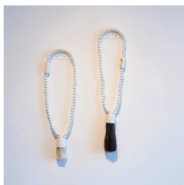
06 Jennifer Ling Datchuk, Black and White , 2021, porcelain and collected human hair, 36 x 10 x 4 inches. $4500