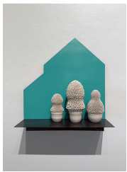
10 Ron Geibel, Everything is Perfect (1) , 2015, porcelain, wood, paint, 28 x 24 x 9 inches. $3000