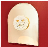
05 Jennifer Ling Datchuk, Flawless , 2024, porcelain, 11k gold luster, 20 x 16 x 3 inches. $3500