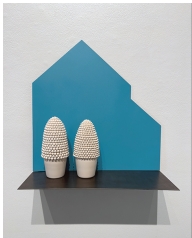
12 Ron Geibel, Everything is Perfect (2) , 2015, porcelain, wood, paint, 28 x 24 x 9 inches. $2000