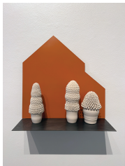
11 Ron Geibel, Everything is Perfect (3) , 2015, porcelain, wood, paint, 28 x 24 x 9 inches. $2750