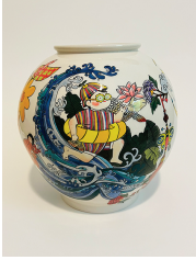
08 Jihye Han, Whispers of the Dreaming Mind , 2024, porcelain, underglaze, glaze, Cone 6 oxidation fired, 10 x 10 x 10 inches. $4000