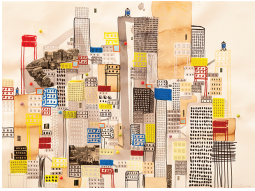
02 Clara Hoag, Charm , 2024, mixed media, 22 x 30 inches unframed; 26 x 34 inches framed. $2,000