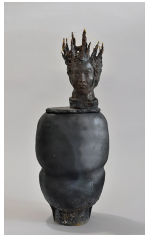
01 Alejandra Almuelle, The Body is a Place -Vase #2 , 2022, earthenware, 29 x 10 x 7.5 inches. $6500