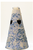
28 Tammie Rubin, Always & Forever (forever, ever) No.20 , 2024, pigmented porcelain, underglaze, 10 x 6 x 6 inches. $875