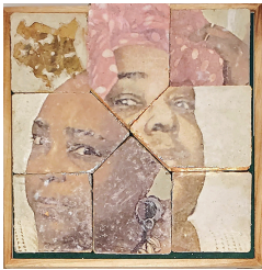
22 Ann Johnson, See and Unseen , 2025, transfer print on poured concrete, intaglio on Sycamore leaf, 16 x 16 x 3 inches. $4000