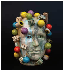
04 Clara Hoag, Hunk , 2024, fired ceramic and glaze, 15.5 x 12 x 13.25 inches. $3750