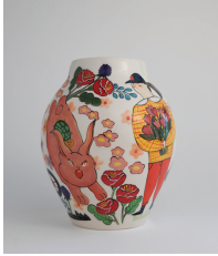
09 Jihye Han, You Have No Idea How Much I Care About You , 2023, porcelain, underglaze, glaze, Cone 6 oxidation fired, 7 x 6.5 x 6.5 inches. $2000