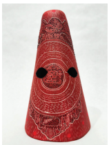
27 Tammie Rubin, Always & Forever (forever, ever) Badge No.1 , 2022, pigmented porcelain, underglaze, glaze, 9 x 5 x 5 inches. $875