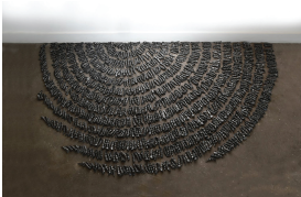
14 Alejandra Almuelle, Body of Temporality , 2024, clay/graphite, variable size. NFS